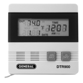
Fig. 4. The DTR900 displaying the time, date and outside temperature

Once you have installed the external sensor cable, the DTR900 will monitor both inside (IN) and outside (OUT) temperatures. This display configuration—with IN and OUT temperatures shown on the left and the TIME shown at right—is the "normal" configuration, as shown in Fig. 1. To switch the IN display at lower left to display the current date (see Fig. 4), press the IN/DATE button. Use the IN/DATE button to toggle the display on the lower left between the inside temperature and the date.