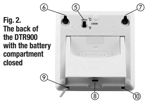
Figure 2 shows the back of the unit with the battery compartment closed. Note: