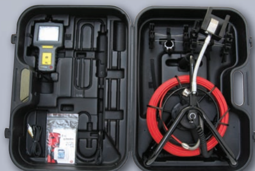
A packaged DPS16 system