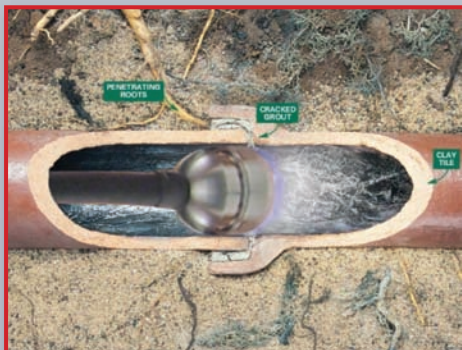
Tree roots cracking and invading a clay sewer pipe