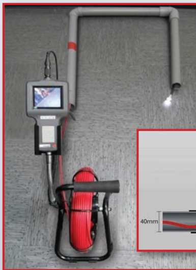
The probe is flexible enough to make two 90° bends in a 1.6 in. (40mm) diameter pipe