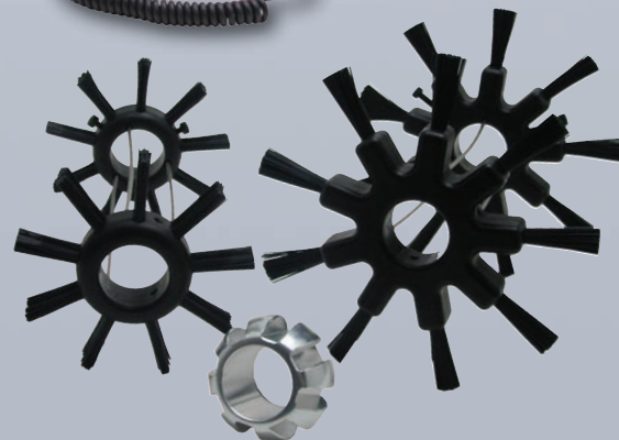
2, 4 and 6 in. probe centering accessories