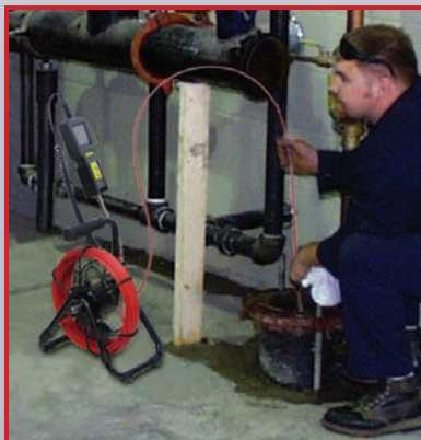
Monitoring the clearing of a clogged sewer drain

The DCS1600 Video Borescope Handheld Recording Console is also available separately as No. H16. It is compatible with all QVGA and VGA resolution probes offered by General, except the P18ART-1SM, -2SM and -3SM articulating probes.