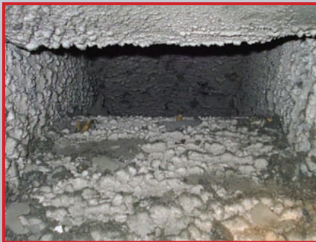
A probe's-eye view of a filthy air-conditioning duct