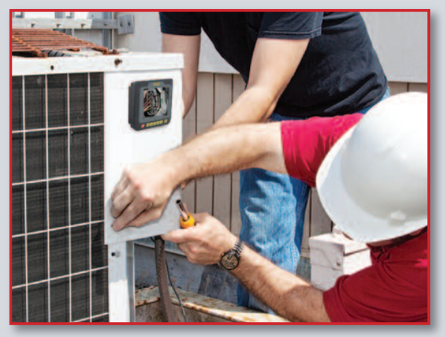
Strong magnetic back and wireless connectivity make this scope ideal for HVAC/R inspections