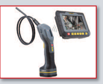
Detachable wireless console features 33 ft. (10m) range