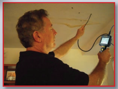
Inspecting a crawl space the quick and easy way