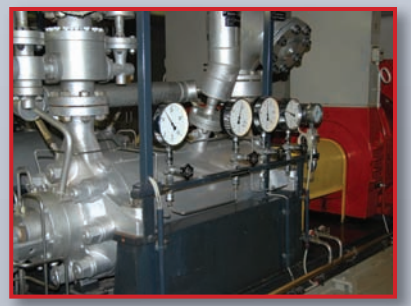
The rugged DCS350 shrugs off the accidental bumps typical of industrial work

Power Source: 4 "AA" or rechargeable batteries