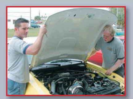
Perfect for driveway mechanics