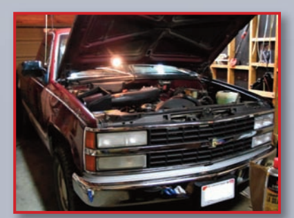
Avoid the time and hassle of engine teardowns