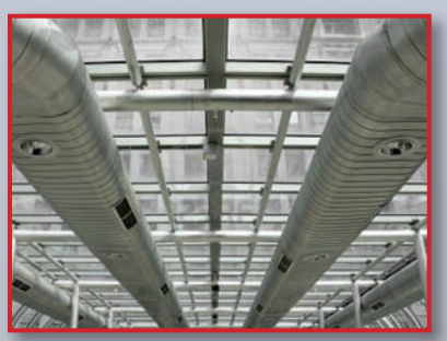
Find blockages or broken registers in A/C ductwork