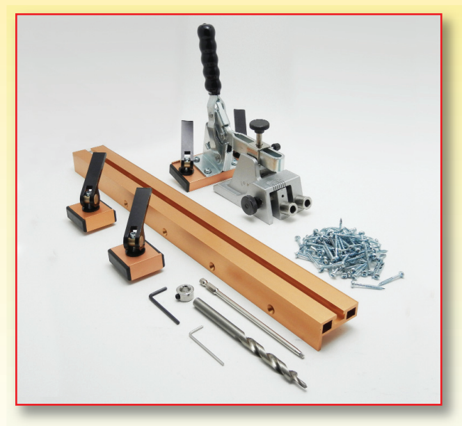
Professional Face Frame Jig System X1 - #8561