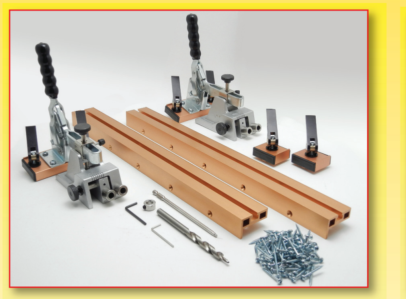
Professional Face Frame Jig System X2 - #8562