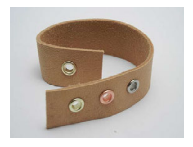
[Photo 7: "Finished" side of eyelets shows on "Smooth" side of work material.

8. If the eyelet can be rotated in the material you will need to repeat the previous step with a bit more force until it holds the material tightly.